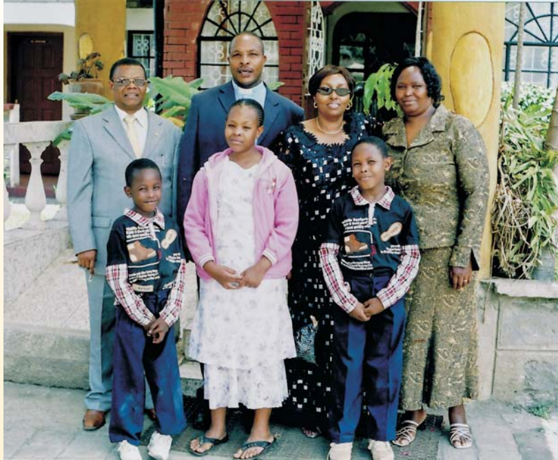
The Diocese Secretary and his family together with AACC staff in Nakuru

The information that reached the secretariat of the AACC