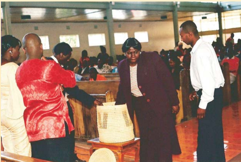
In the Nakuru Cathedral, the congregation offering for the African Dignity campaign

We are also informed that in other parts of Africa, the same campaign is being successfully conducted and we have all the reasons to believe that the process of ownership of the AACC is in progress. We thank God for this.