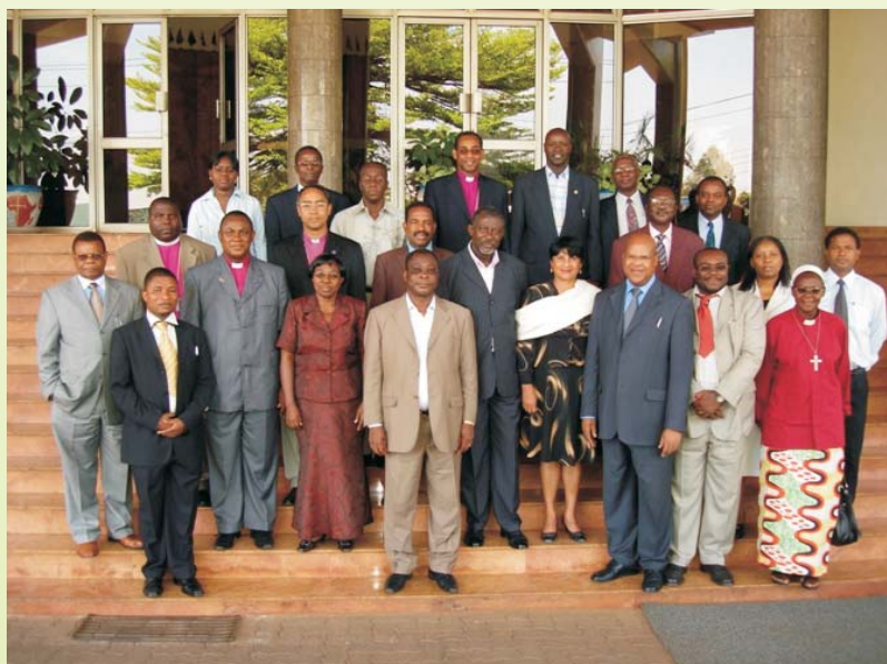
Church leaders who participated in the Climate Change workshop, together with some of the AACC staff members.

Climate Change is a major challenge of our time. Reading from the Bible, in particular the book of Genesis and looking at the world geostrategy church leaders from the Cameroon, Central Africa Republic, Togo, Burundi, Rwanda, Madagascar and Zimbabwe have committed themselves to be agents of change in their countries. Church leaders expressed the hope that the seminar will equip them with scientific facts that will help them in understanding the root causes and the consequences of the Climate change. They call on churches and Christians to empower the populations and